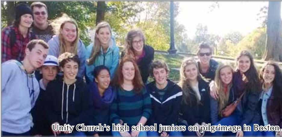
Unity Church's high school juniors on pilgrimage in Boston.

I accidentally overheard a conversation this past week. It went something like, "My religion? Oh, it means you can believe whatever you want to believe." A shudder ran through my body. I almost ran up and interrupted the seemingly private conversation between a member of our congregation and a curious friend talking about Unitarian Universalism. Throughout my life as a Unitarian and then a Unitarian Universalist, I have often heard this explanation of our liberal non-creedal faith. Though it breaks my heart now to hear it, I understand the impulse. It can be difficult to explain Unitarian Universalism to strangers to our faith. And for years it was the definition that I offered to questioning people about the religion I claimed as my own.