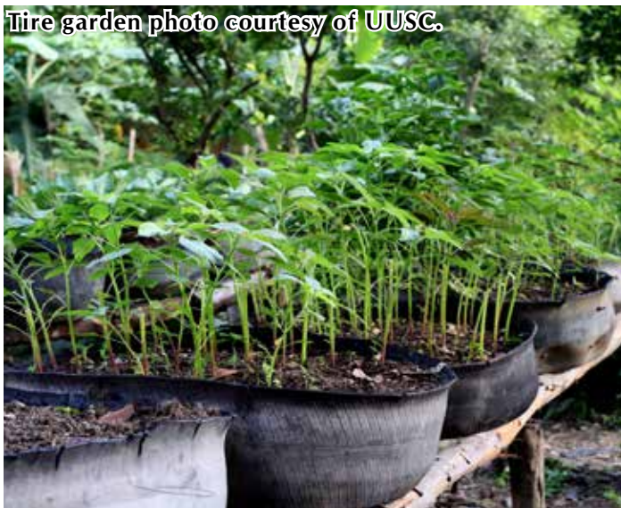
Tire garden photo courtesy of UUSC.

To support this and other UUSC human rights projects please visit: www.uusc.org .