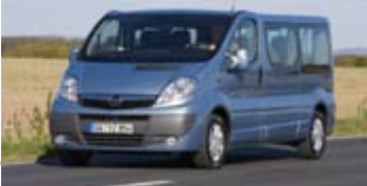
The new van!