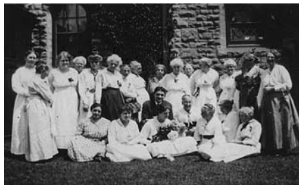
Women's group, Unity Church

Saturday, March 13 10:15 a.m. Following the pancake breakfast.