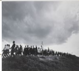
How the Civil Rights Movement Tested and Changed Unitarian Universalism