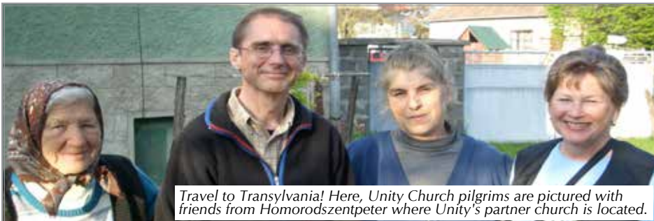
Travel to Transylvania! Here, Unity Church pilgrims are pictured with friends from Homorodszentpeter where Unity's partner church is located.