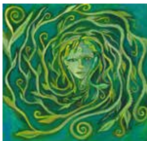
Vine Labyrinth Woman

I paint because it heals me. I can feel my own essence and express myself. I love the feeling language in the colors, shapes and textures of abstract art. Yet I want more. I believe I can connect with my audience and myself more deeply using the language of the human face and figure. Body language is something we all innately understand and the gesture says so much. I am fascinated by the geometry of mandalas and how interesting the figure can be as a design element repeated in the circular format. I paint, sculpt, print, and design the figure into themes of nature spirits, goddesses, angels, and lovers. They are all self-portraits of facets of my own inner spirit. www.jenniferkunin.com