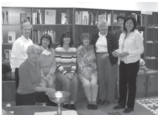
The Unity Quilt Group's "Block Club" meets on occasional Saturdays to work on their quilting projects.