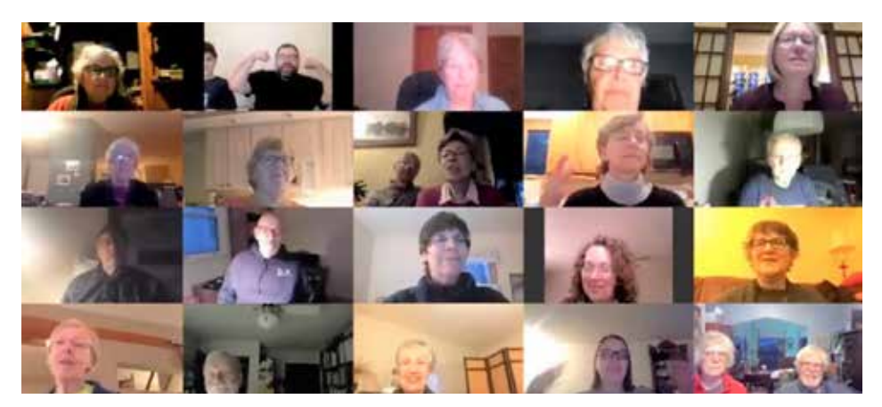
Unity choirs continue meeting — and singing — together via Zoom!

I've built my career around bringing large groups of people together and, unfortunately, no one really knows when that can safely start happening again. However, I do know that when it does happen, I will not take it for granted. My first church year at Unity is not ending the way I expected but I did not expect a second year that was so full of possibility and excitement. Now my days are filled with thoughts of the music we will create when we are back together and what that music will sound like as we inflect it with the joy and gratitude of being with each other, as we pour into it our collective experience throughout this crisis. I know it will be magical.