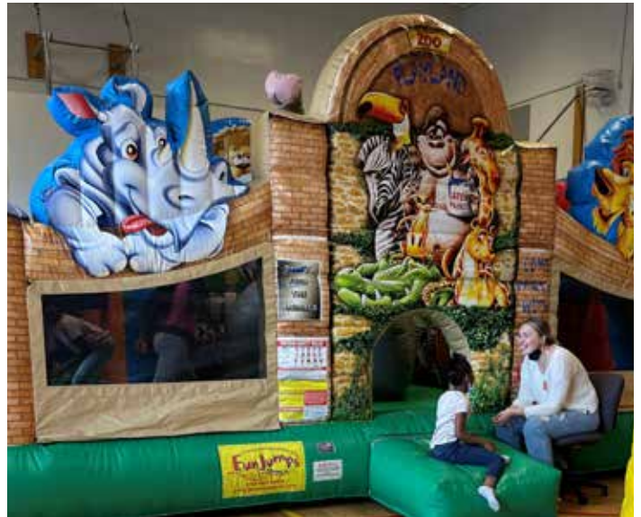
Scholars and volunteers enjoyed time together at the school carnival on June 1.

Thanks to everyone who contributed to our work in supporting the scholars, staff, and teachers of Barack and Michelle Obama Elementary School this year! From those giving to the church offering last fall, to people who brought treats for the monthly teachers' meetings, to those who assisted with Staff Appreciation Week in May, to those who helped watch over the children during the carnival on June 1, and those who worked to get the library in good shape at the end of the year — we appreciate you all!